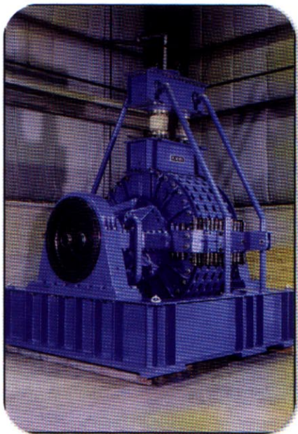
Used for development testing of industrial and marine gas turbines, this Kahn dynamometer is rated 60 000 kW at 4500 r/min and weighs over 36 000 kg.

this dynamometer was capable of absorbing 37 000 kW at speeds up to 4500 r/min. At the time, with a dry weight of over 36 000 kg, it was the largest hydraulic dynamometer manufactured in the United States. When the dynamometer was finally replaced with a new and more powerful Kahn dynamometer after 20 years of continuous service, it had logged over 27 000 operating hours still using its original power elements.